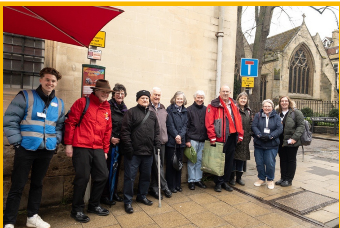
Attendees of Oxford Bus Company's 'Chatty Bus Day Out' in March 2023 enjoyed free bus travel to Oxford and a complimentary open-top bus tour around the city.

Our colleagues at Oxford Bus Company have hosted a series of 'Chatty Bus' events to battle loneliness in their communities. In March 2023, elderly people living in Abingdon were invited to enjoy a day out in Oxford with free bus travel and a complimentary City Sightseeing Oxford open-top bus tour. The event was a success – not only were all the spaces filled, but many attendees explained how they benefited from socialising with new people.